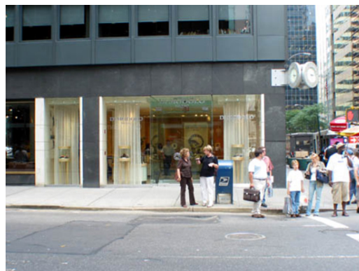
635 Madison Avenue, New York